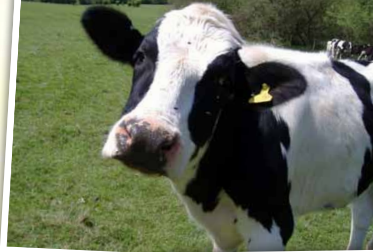
The best fridge money can buy?